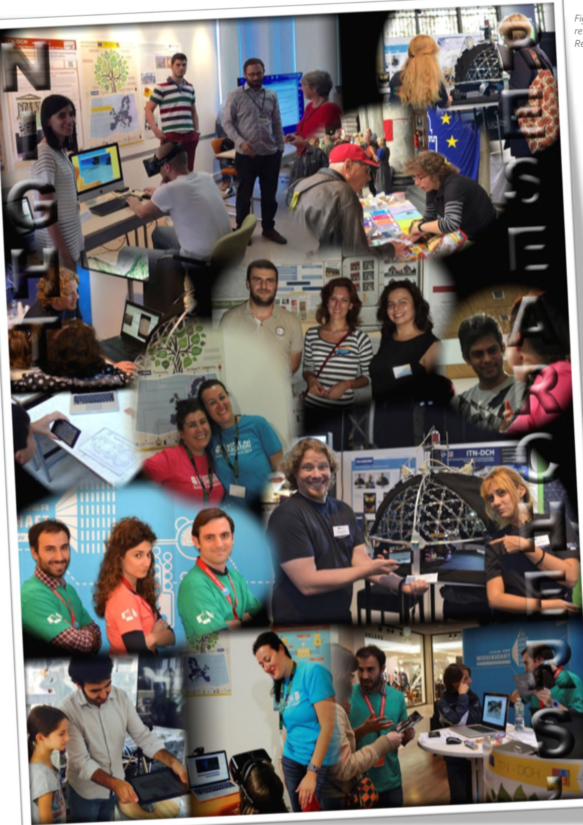
Figure 6:All the ITN-DCH researchers taking part in the Researcher's Night